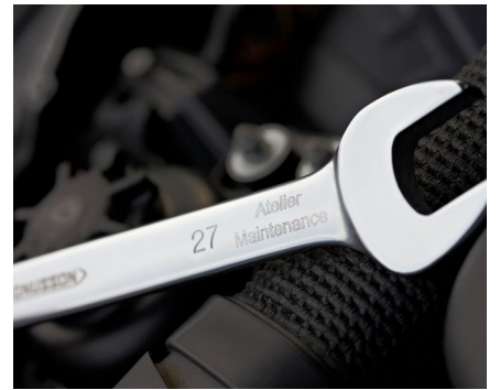
Marking tools for identification and equipment traceability