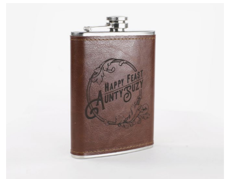
Gifts & personalization